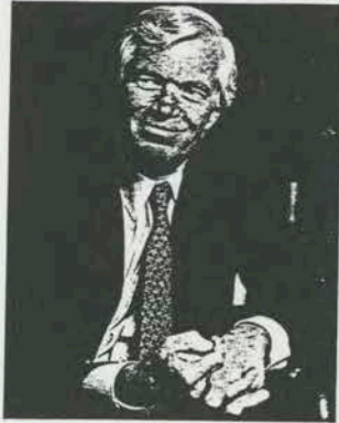
SENATOR THAD COCHRAN

"Senator Thad Cochran has served our state and nation well in his leadership role in the U.S. Senate. The Congressional Archives will honor his invaluable service and his dedication, along with that of other Mississippi statesmen."