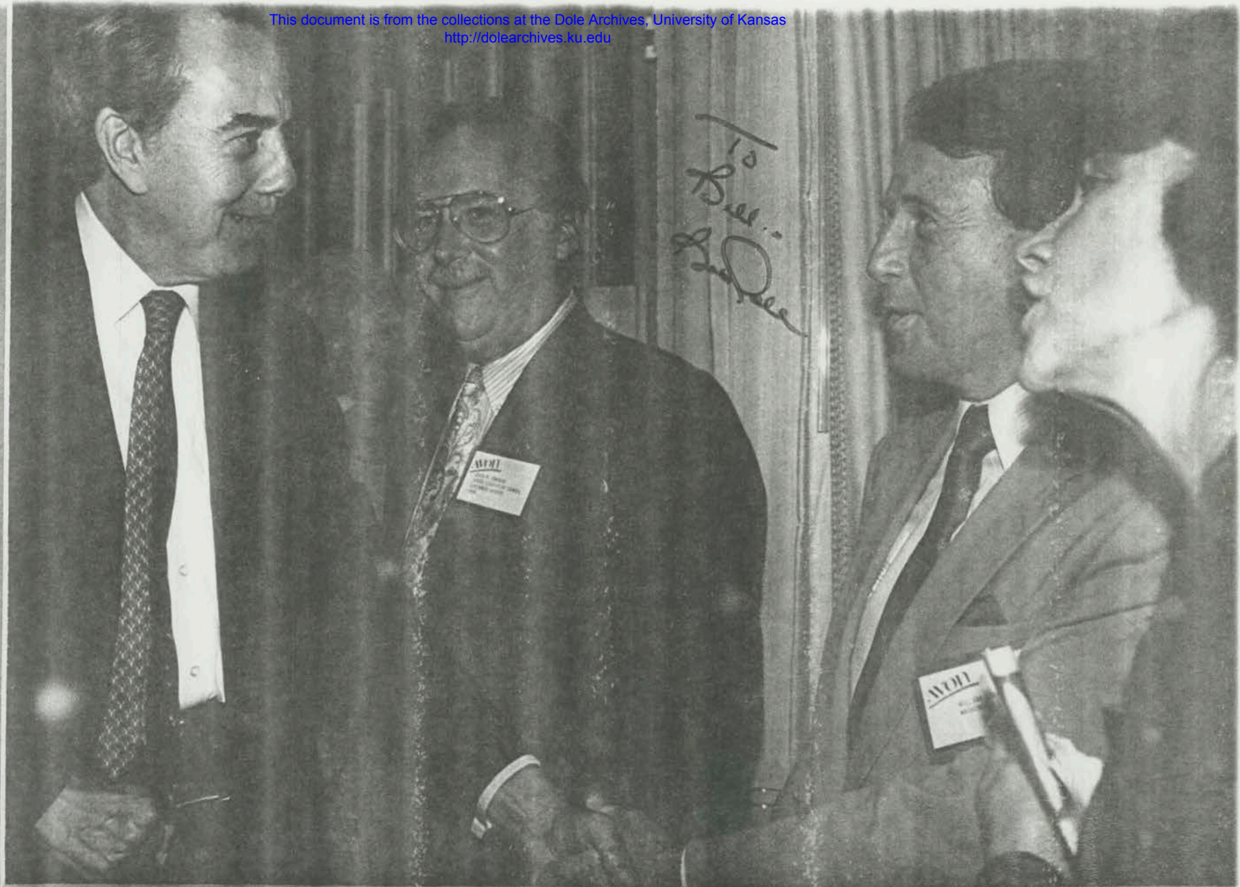
Campaign '88 Program Republican National Convention August, 1988