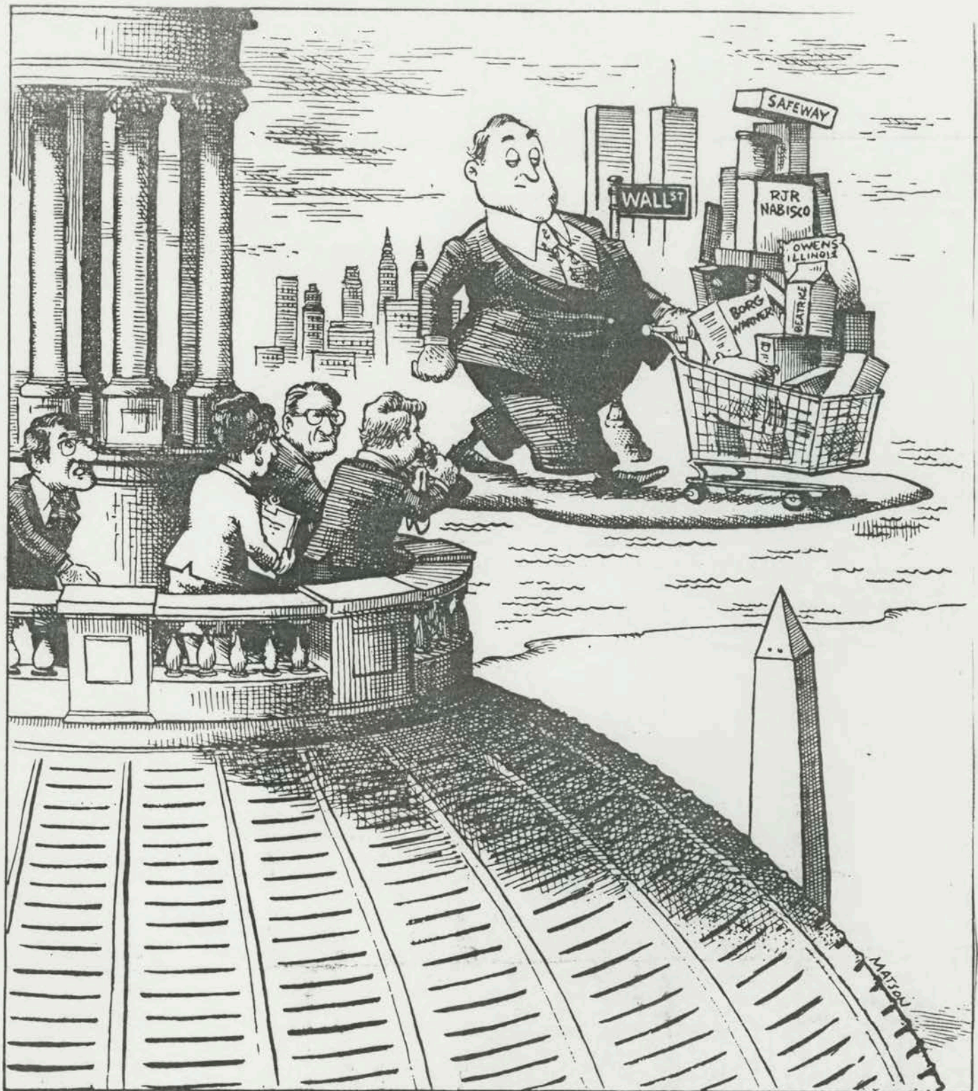
BY R.J. MATSON FOR THE WASHINGTON POST