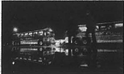
The buses take a pre-dawn break in Salina to pick up an additional supporter.