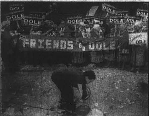
After the ceremonies, an unidentified boy scavenges balloons as the bus entourage poses for photographers.