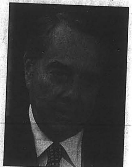
Bob Dole will announce his presidential campaign in Topeka on April 10.