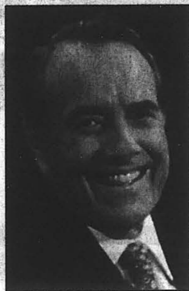
Sen. Bob Dole Kansas senator will formally announce his presidential campaign on April 10 in Topeka.