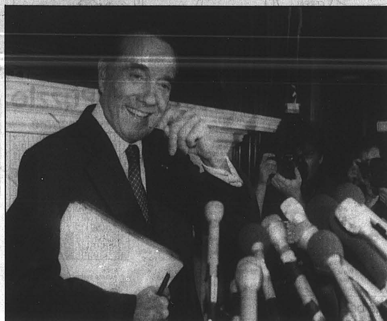
THE RACE FOR THE WHITE HOUSE — Senate Majority Leader Bob Dole of Kansas smiles prior to a news conference on Capitol Hill Wednesday, to discuss Tuesday's election where Republicans took over the Senate and the House. Dole is considered to be among the GOP presidential hopefuls.

Campaigning for the ticket in the off-year builds credits that help when it comes primary and