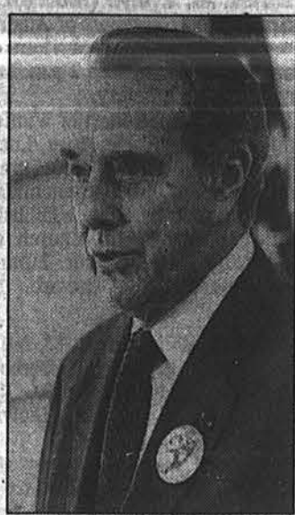
Sen. Bob Dole praised the work done at McConnell to rebuild from the 1991 tornado. "I hope McConnell is going to be here for a long time."

And this hospital has one more thing that the old one didn't: a tornado shelter.