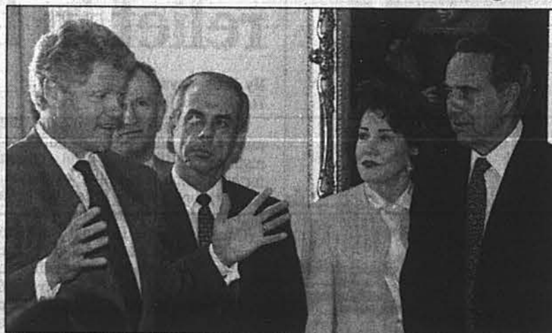
President Clinton praises Sen. Bob Dole's work on behalf of Americans with disabilities Thursday at a Washington luncheon for the Kansas Republican, at right with his wife, Elizabeth.

"Too many handicapped persons lead lives of loneliness and despair," Dole said in 1969. "Too many feel, and too many are cut off from our