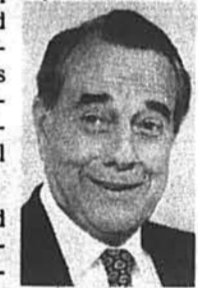
Sen. Bob Dole

Dole also said during a news conference as he concluded a two-day trip to his home state that he is ready to give newly appointed Whitewater investigator Robert Fiske the benefit of the doubt and "see what he can do."