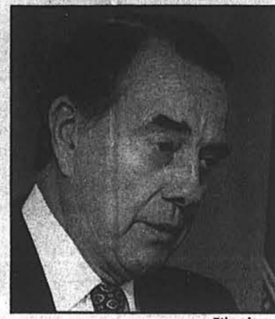
Sen. Bob Dole says he would like to serve as host for "Saturday Night Live" if it doesn't take too much time.

gram with some off-color ...," he said, trailing off. "So they said I could have control of that."