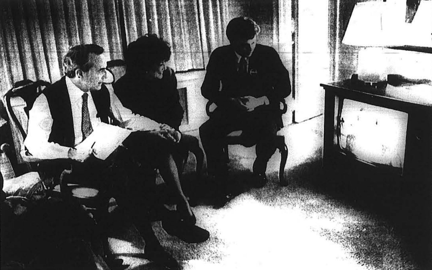
Watching his Iowa victory unfold, Sen. Bob Dole of Kansas follows televised results Monday evening at his hotel in Des Moines, accompa-

Korea. Analysis, A-7 ■ What will lowa's results mean in New Hampshire? Depends on whom you ask. A-7