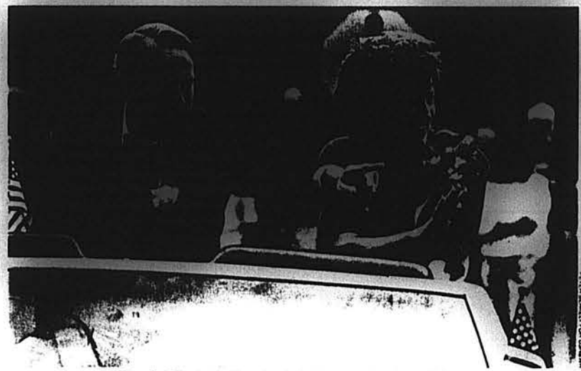
With wife Elizabeth: Tough-mindedness and twin ambitions