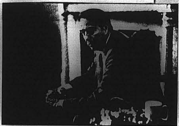
Reluctance to go for it all out: A pensive Senate leader