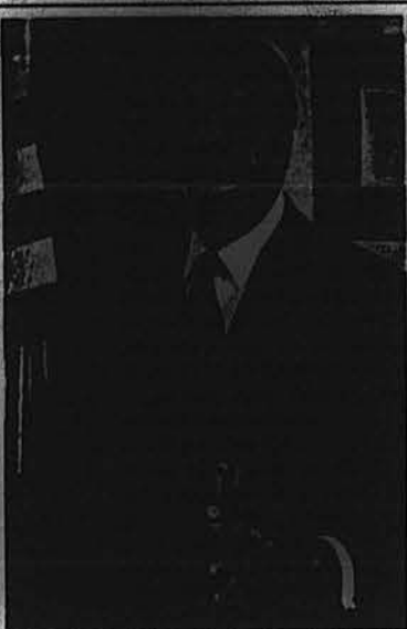
New Dole Lite: less acerbic, more personal