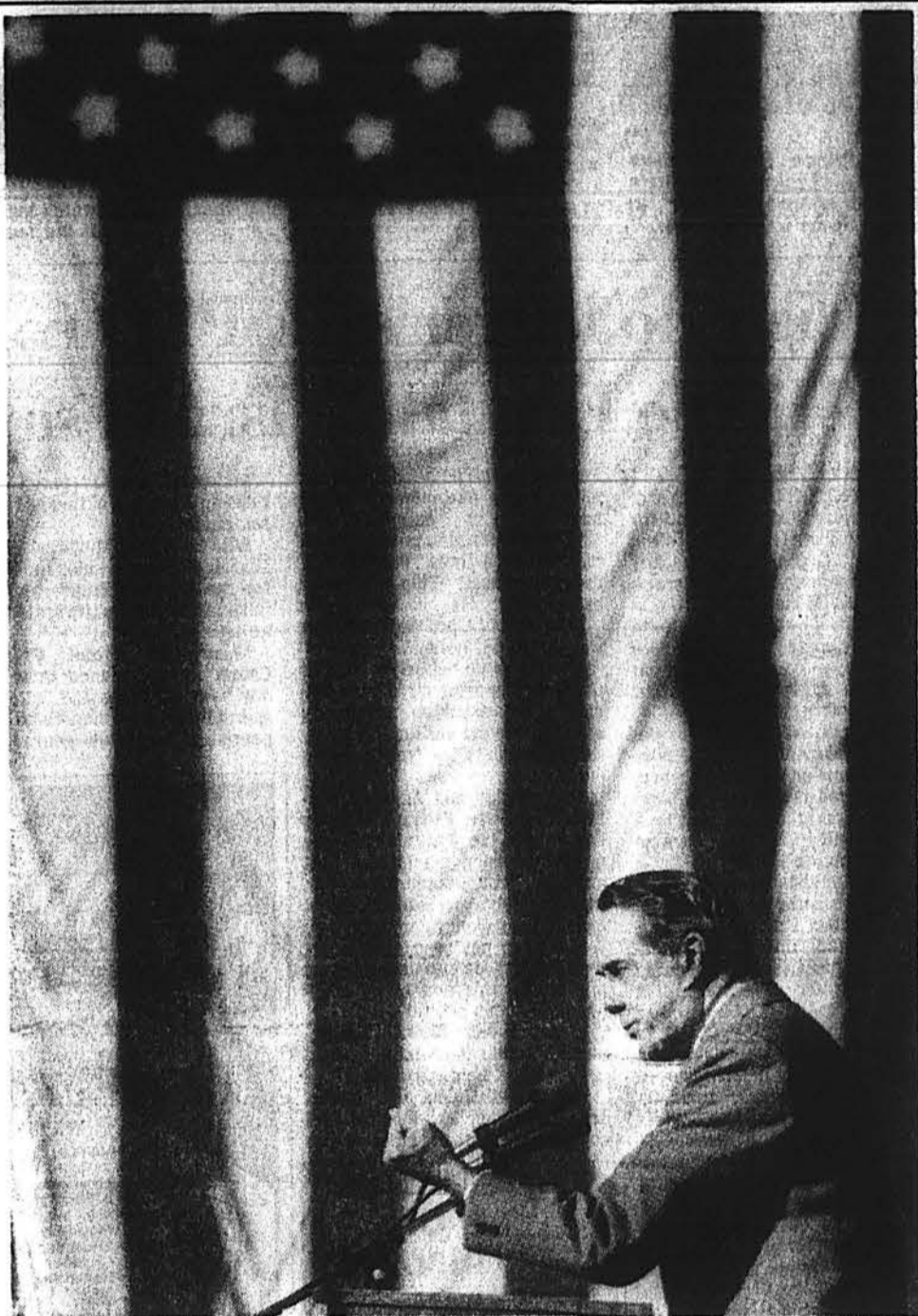
■ Crowd gets charged up for Dole in Russell, 4A. ■ The cold overwhelms some supporters, 4A. ■ TV coverage of the announcement varies, 1C.

THE WICHITA EAGLE-BEACON Tuesday, November 10, 1987 5A