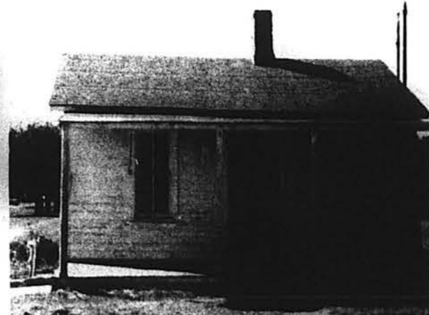
BIRTHPLACE OF BOB DOLE —This is the house, now razed, in which Bob Dole was born in 1923. The house was located on N. Maple Street, a block south on the west side of the street, from the Bob Dole house at 1035 N. Maple St.