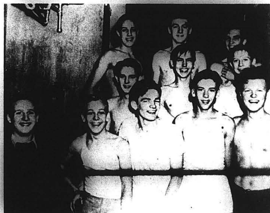
JUNIOR HIGH—BASKETBALL —Bob Dole, a member of the Russell Junior High basketball team, is on the left of the top row. Dole was not a star basketball or football player, but he was always on the team. He excelled at track.