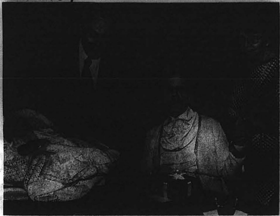
BOB AND BINA DOLE visit the Russell Elks Lodge on April 2, 1983, during Bina's birthday celebration at the lodge.