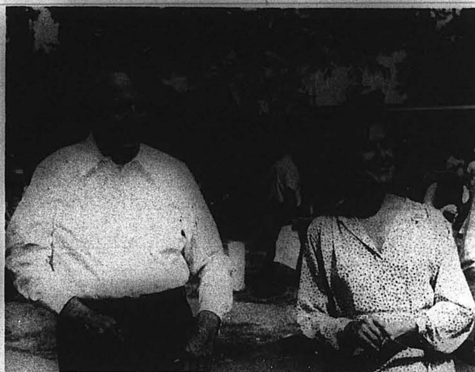
BOB AND ELIZABETH DOLE were dressed informally for the Kansas heat on Sept. 7, 1980, while they greeted friends at the Kansas State Fair in Hutchinson. Dole was running for his third term in the United States