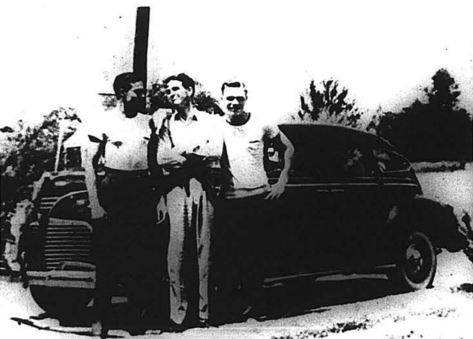
THESE THREE YOUNG BRONCOS are standing alongside either a 1940 or a 1941 Plymouth sedan. From