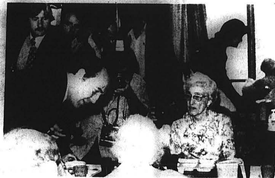
DIFFERENT ROUTES —for similar best wishes in the AlaFern Nursing Home, Jewell and Elm streets, Monday morning as Bob Dole, left, talks with two residents as Elizabeth Dole, at right, talks with others at breakfast table near the window.