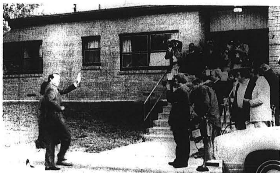
PRESS CORPS turned out early Monday morning to welcome the Doles at a 7:30 a.m. visit to the AlaFern Nursing Home. The cameras and newsmen followed the Dole party through a series of pre-announcement stops in Russell.