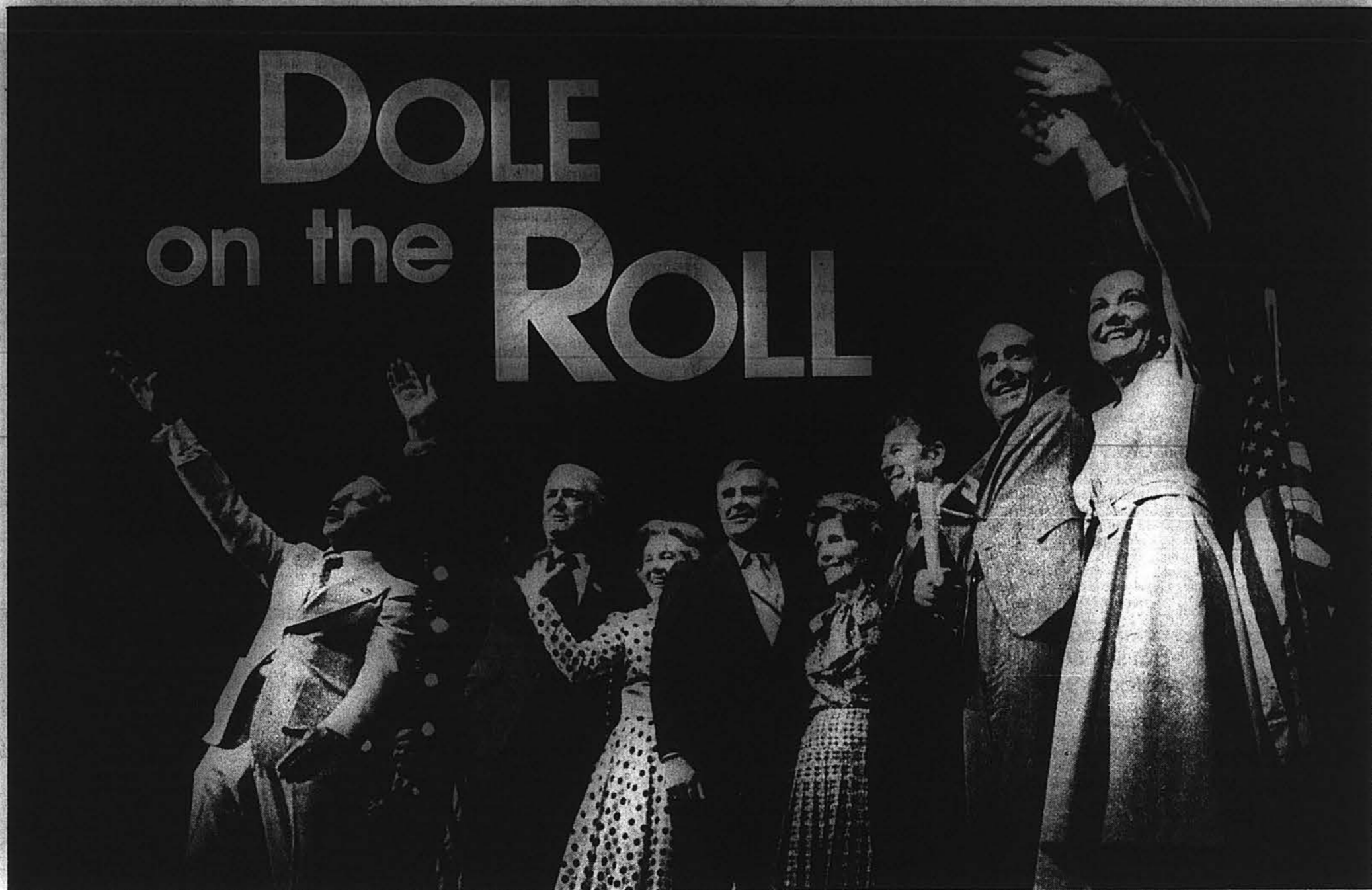
He comforts conservatives, plays to the cameras and draws support from Reagan and other GOP powers. It's Gerry Ford's horse race this year but Kansas' junior senator foresees his own presidential stakes in 1980. If Ford wins this one, that is.

The Sunday Magazine Section of the Topeka Capital-Journal