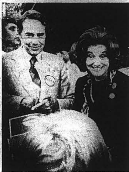
Queen of the stump is Elizabeth Hanford Dole, on leave from the Federal Trade Comm., and working crowds with charm.

"We can't make policy," Dole said when asked in an interview about the role he and Democratic vice-presidential nominee Walter F. Mondale of Minnesota play in the campaign. "I can't stand up and say this will be done in the Ford-Dole administration because I'm the vice presidential candidate, Mondale can't say it either, and I'm under even further restraints