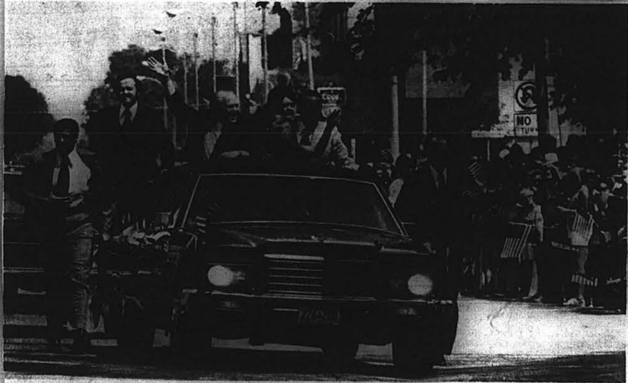
THE PRESIDENTIAL CARAVAN arrived at the Russell Courthouse shortly after noon Friday. The visit by President Gerald Ford and Sen. Bob Dole, vice-president nominee, opened the 1976 presidential campaign for the Republicans. Dole, a Russell native, was tabbed by Ford as his running mate Thursday at the GOP convention in Kansas City. Ford and Dole flew from Kansas City to Salina Friday morning and then boarded a helicopter which brought them to Russell.