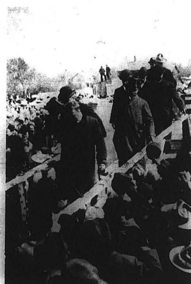
CONTRAST! American President Theodore Roosevelt is shown doffing his top hat as he makes his way down a ramp during a whistle stop visit to Russell in May, 1903. The platform was erected adjacent to the Union Pacific mainline through Russell and was reached from the observation platform of the presidential train. The picture is from a commercial stereopticon slide.