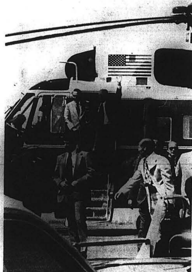
FRIDAY NOON President Gerald R. Ford and Sen. Bob Dole arrived in Russell to open their 1976 GOP campaign. It was the second visit of an incumbent President to Russell. The first was in 1903 when Teddy Roosevelt stopped in Russell, traveling by train. Thousands of people waited at the courthouse Friday to get a glimpse of the presidential team.