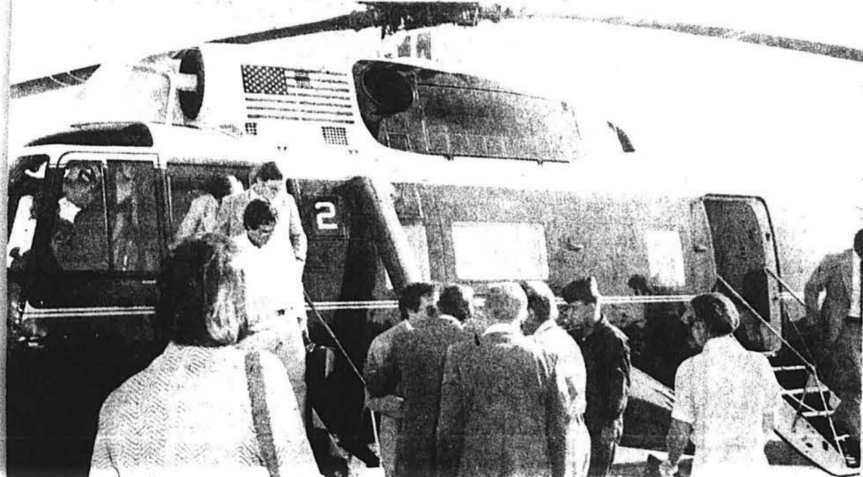
NEWS MEDIA converged on Russell shortly after dinner Thursday after President Gerald Ford had announced the selection of Sen. Robert J. Dole as his running mate for the November election. The Russell community immediately became a beehive of activity. Within hours the wheels began to roll to organize a visitation by Ford and Dole Friday.