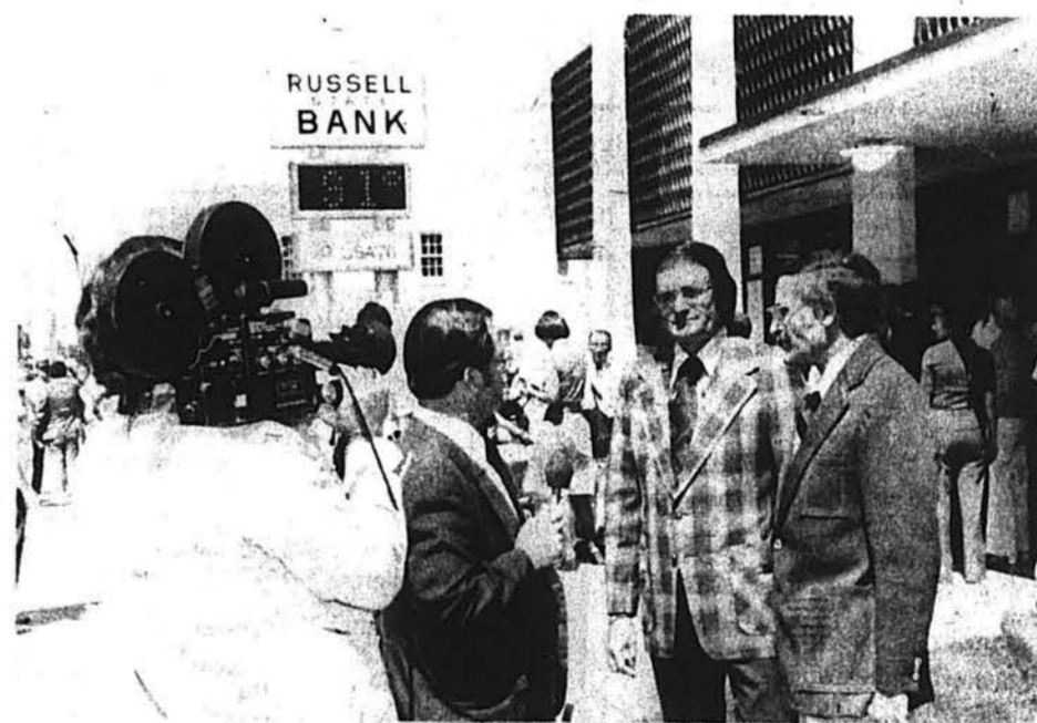
THE RUSSELL STATE BANK November general election. Above the was the central focal point for the news media Thursday afternoon after the announcement reached Russell that their hometown boy, Sen. Bob Dole, had been selected by President Gerald Ford to be his running mate in the