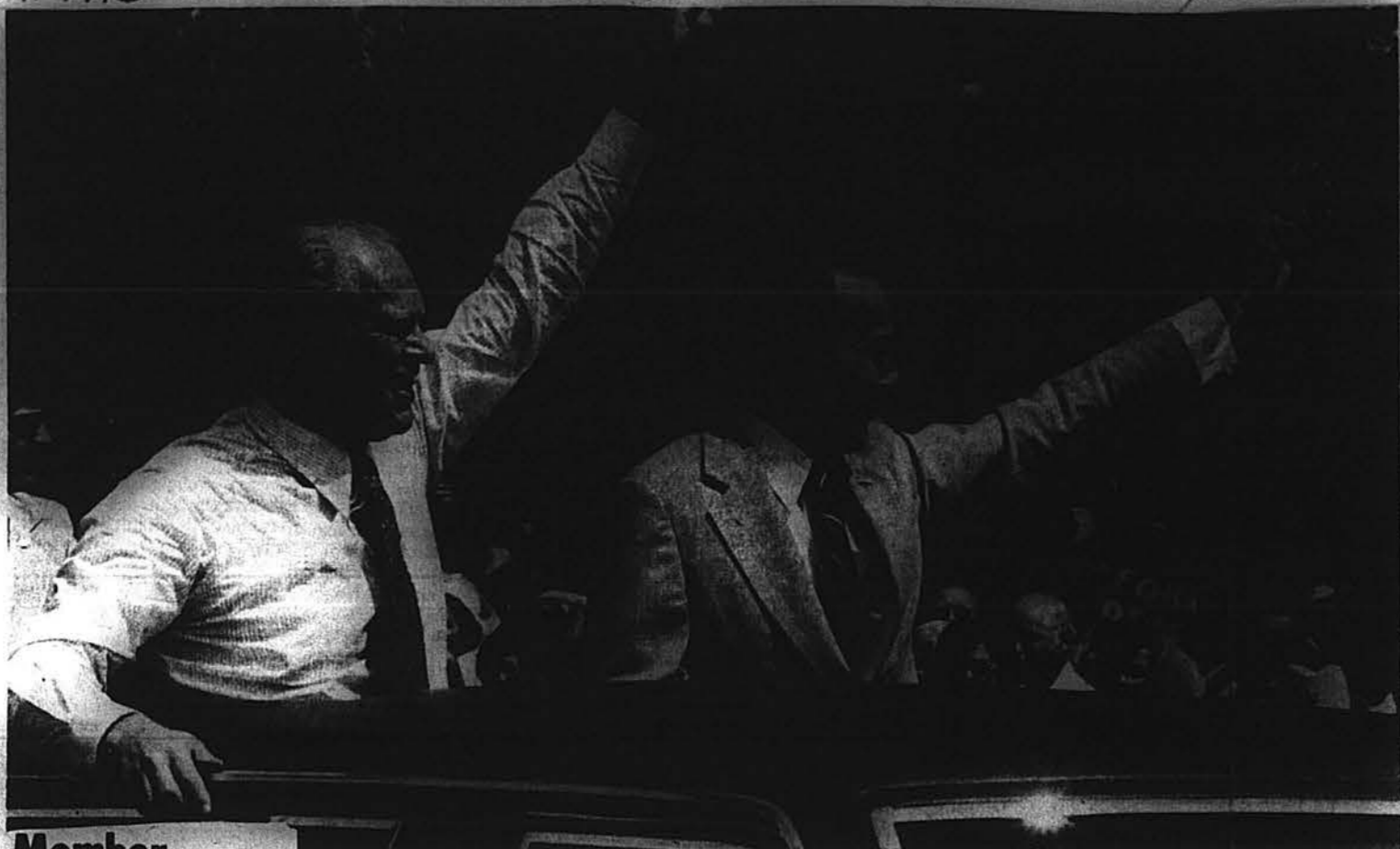
Member— (Continued From Page 1) PRESIDENT GERALD FORD AND SEN. BOB DOLE WAVE GOODBYE.

Republicans, state officers, and party workers Friday night. Those called were urged to attend and to notify others.