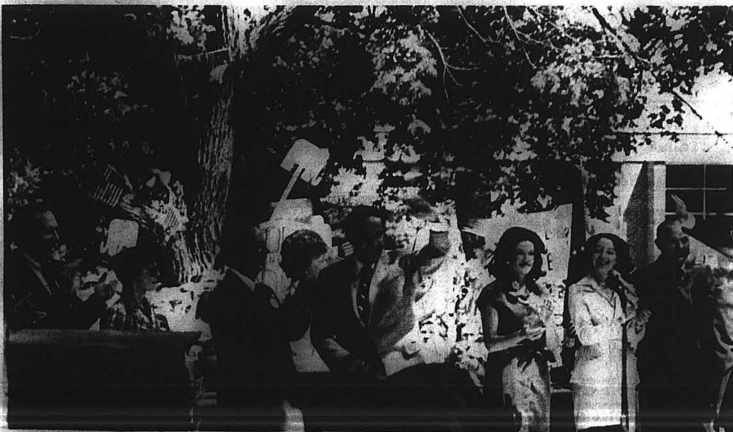
SEN. BOB DOLE WAVES TO HIS HOMETOWN FRIENDS.