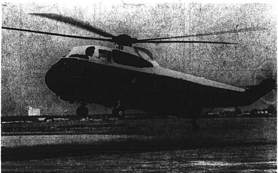
ADVANCE PARTY ARRIVES BY HELICOPTER FRIDAY.