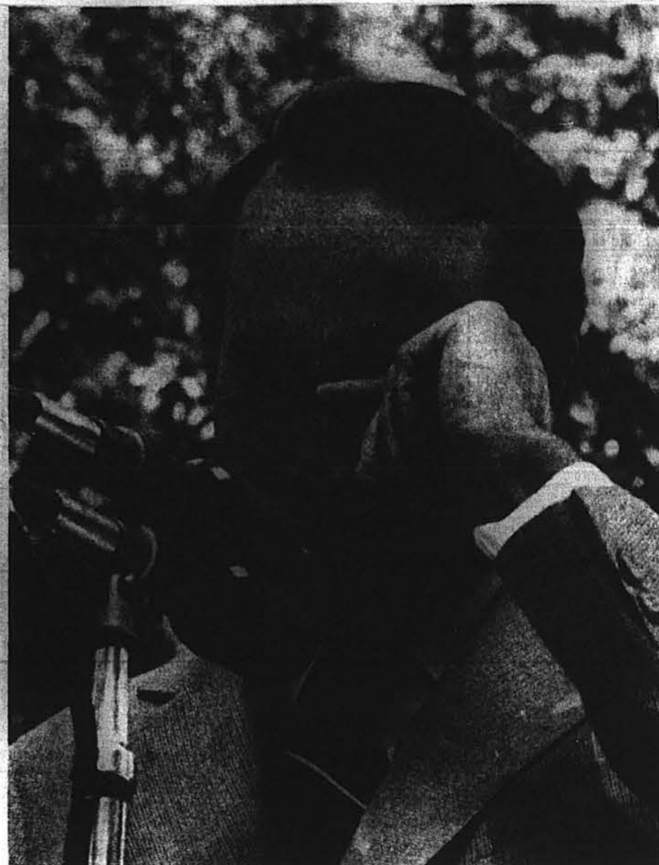
EMOTION IS TOO MUCH for Sen. Bob Dole Friday as he broke into tears and sobbed while addressing the crowd at Russell during the Presidential visit.