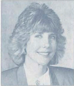
Joni Eareckson Tada