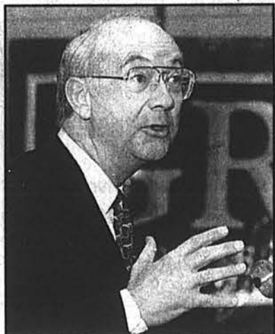
Sen. Phil Gramm (left) believes he's laid the foundation to carry Arizona next year, but Sen. Bob Dole (right) has other ideas.

8 Sunday, January 29, 1995 The Salina Journal