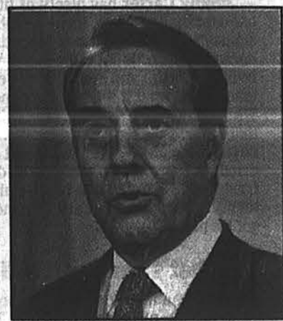
Sen. Bob Dole has been carefully separating himself from the GOP pack.

8 Sunday, January 29, 1995 The Salina Journal