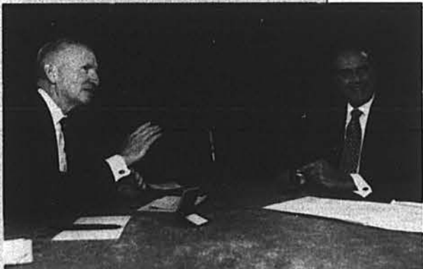
ROSS PEROT LIVE: The potential party leader banters with Dole on CNN