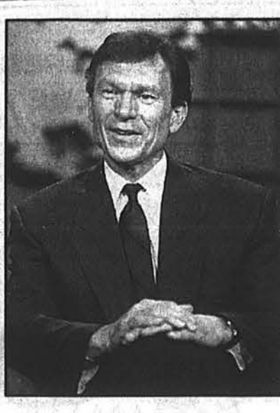
Sen. Tom Daschle is among the Democrats distancing themselves from President Clinton