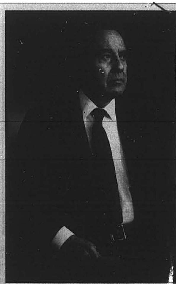
'He puts you in the deep freeze': The senator

paign-or the presidency. Interviews with more than two dozen current and former staffers reveal a lot about Dole's executive skills-and his anyone's judgment but his own. "If | temperament. Dole demands the best