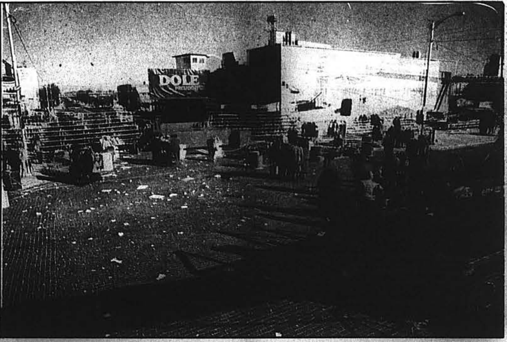
The above photos show the streets of Russell Nov. 3 and again Monday, after most of the crowd had dispersed following Dole's presidential announcement.