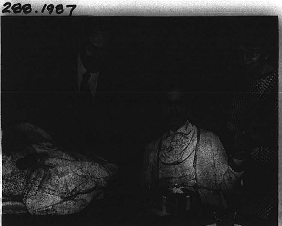
BOB AND BINA DOLE visit the Russell Elks Lodge on April 2, during Bina's birthday celebration at 1983.