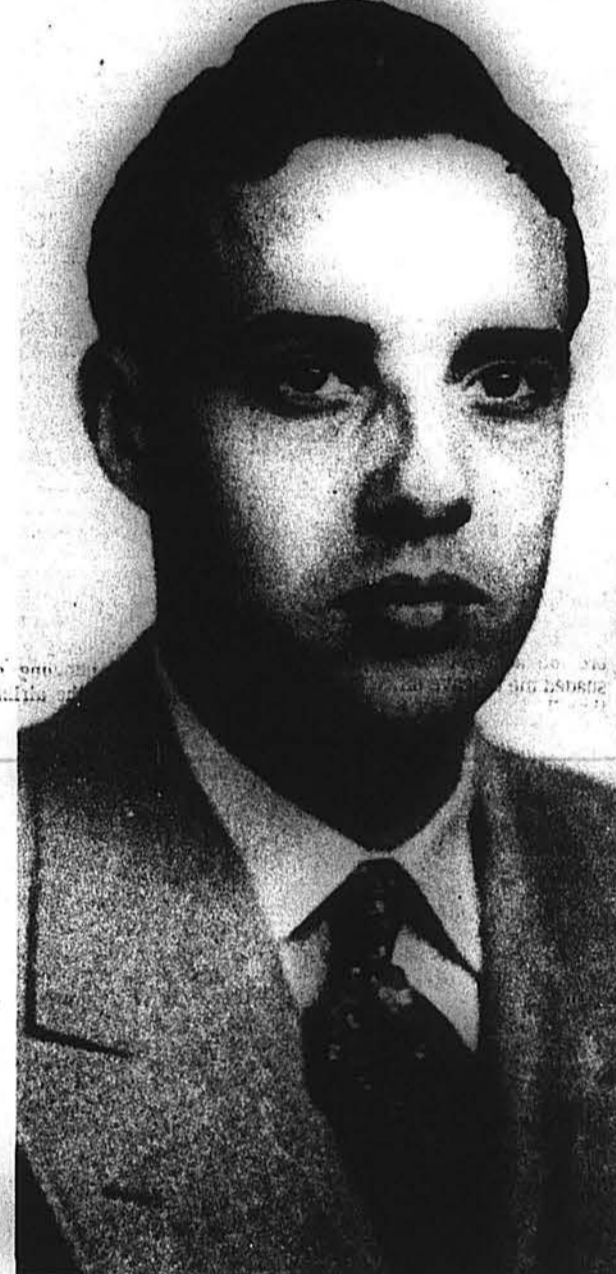
AS COUNTY ATTORNEY — This picture of Robert J. Dole was taken in 1959 while he was serving his fourth term as county attorney of Russell County. The next year, in 1960, he made his first race for the United States Congress, and was elected.